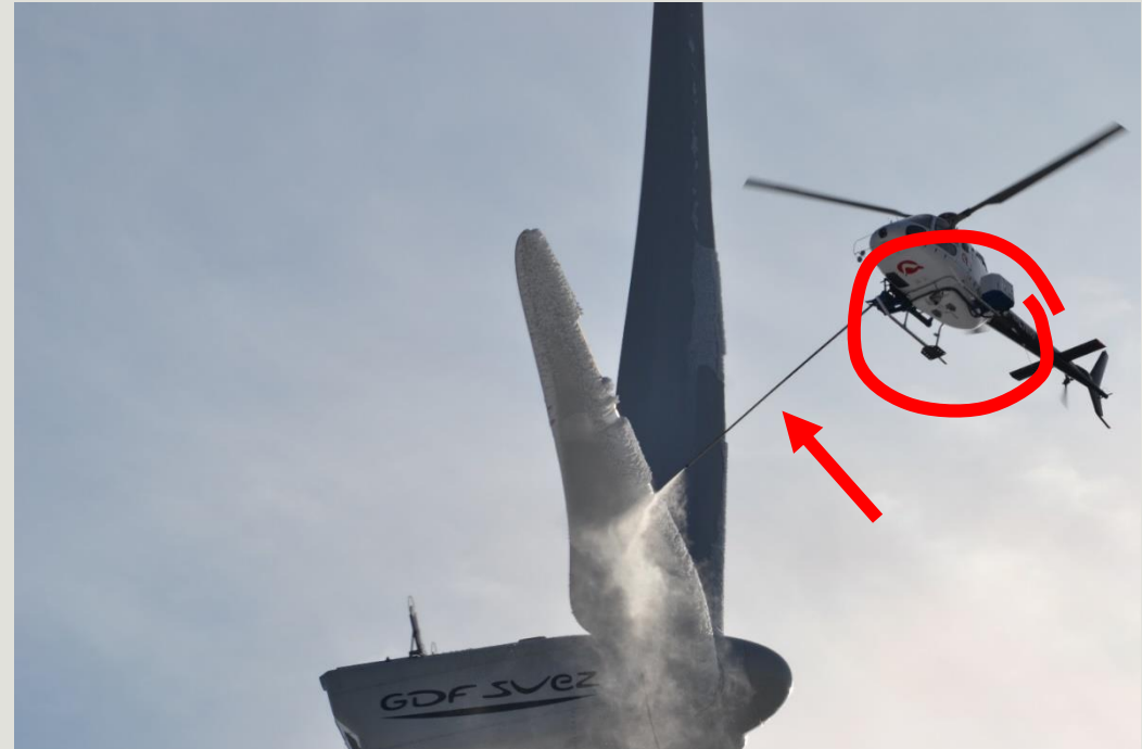
De icing (Vestas V90) with hot water and a helicopter in Canada

However, it takes too long due to the fact that the equipment works more like a high pressure washer, similar to a snow making machine